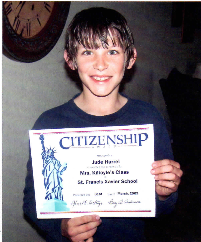
Special to SWFL Parent & Child